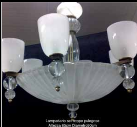
Lampadario sei bobbe pulegose Altezza 65cm Diametro90cm